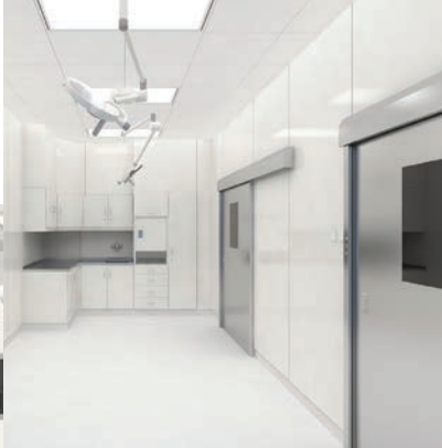
Staff & Patient Prep Rooms