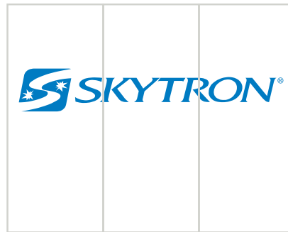
Logo Wall Panel Design