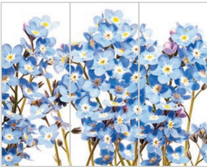
Floral Wall Panel Design

Steel and glass walls are a growing trend in hospitals due to their hygienic qualities as well as compelling design. The EASE art catalogue includes more than 200 graphic motifs, mainly inspired by nature, because of its soothing effect on patients and hospital staff. Our team is here to help you choose the optional colors and graphics for your facility.