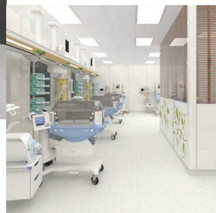
Intensive Care Units