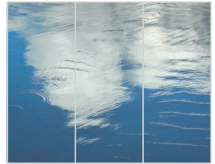
Nature Wall Panel Design